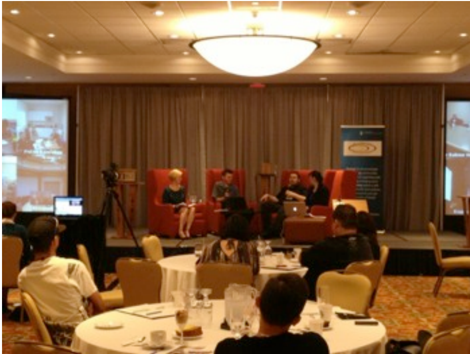
UBCLC at the STRONG Conference, May 2013